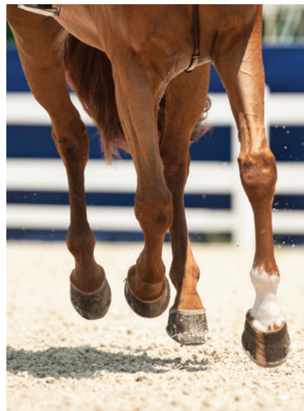
AMY K. DRAGOO

Work your horse on quality surfaces to increase growth-stimulating circulation to the hooves.